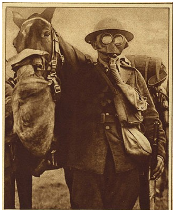
NOT ONLY THE MEN, BUT HORSES, ARE COMPELLED TO WEAR MASKS, AS THESE UNITS OF BRITISH CAVALRY ARE DOING, WHEN IN GAS INFESTED REGION.