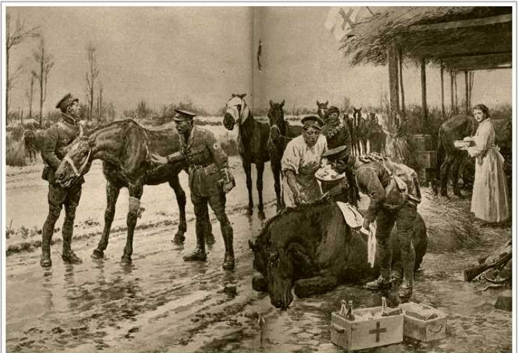
CARING FOR THE WOUNDED WAR-HORSE AT A BLUE CROSS HOSPITAL