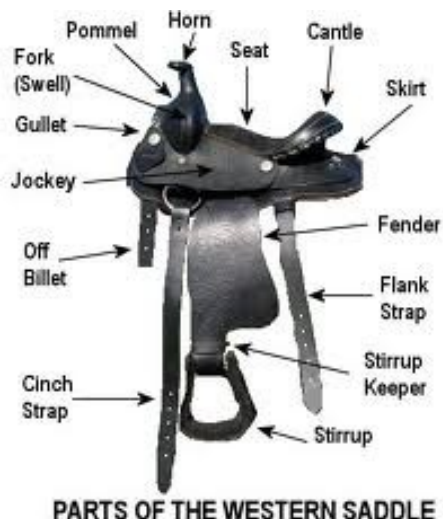
PARTS OF THE WESTERN SADDLE